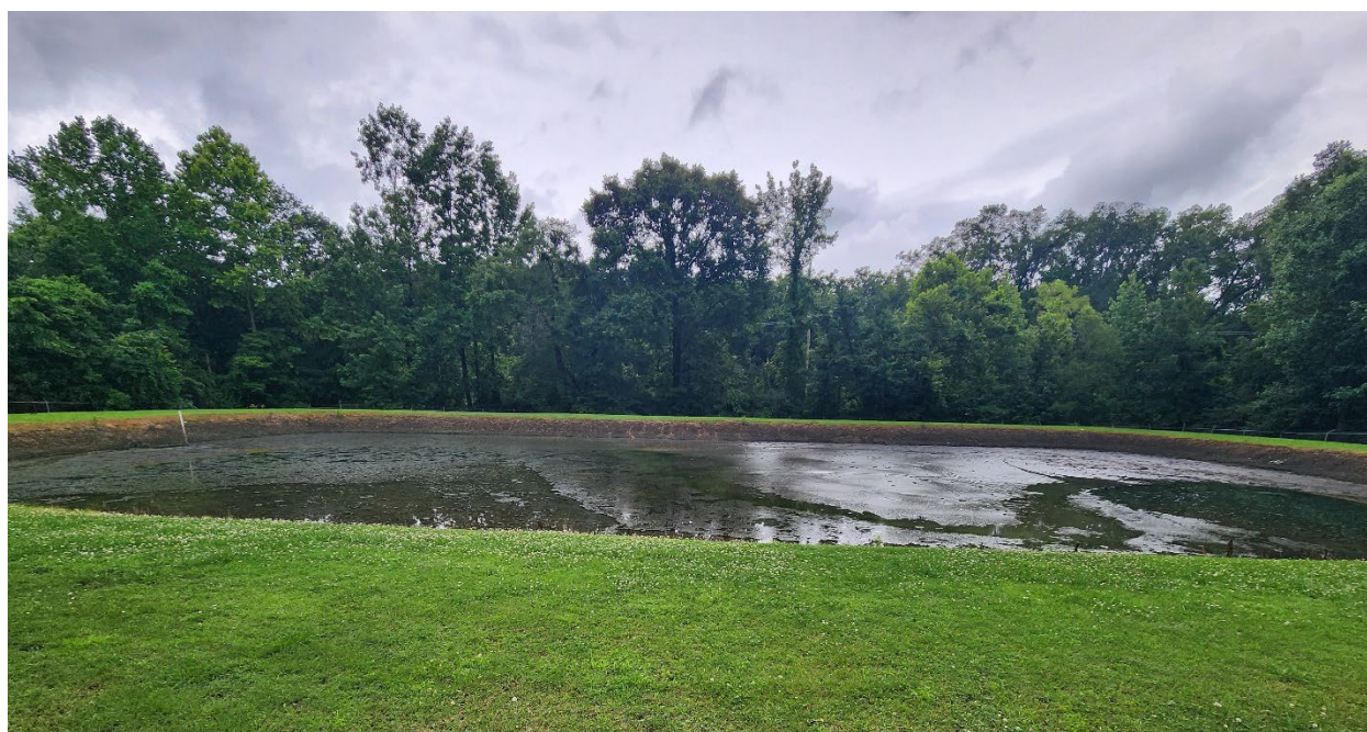
Figure 1: Reservoir on the Tennessee River

The Tennessee River water possess the usual challenges of metals (Fe, Mn) and background organics such as TOC, DOC, NOM and THM & HAA precursors. The source water faces the additional challenge of PFAS contamination that changes in concentration and composition with seasonal and weather events to exceed regulatory standards.