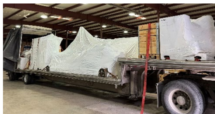
Cuf plant ready for delivery