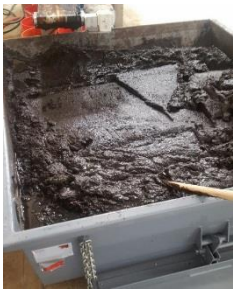
Recovered DOC & Fe

Concentrated DOC and Iron is filtered by Cuf and further dewatered by the integration of the DeWatering Recovery System (DeWRS). The integrated process eliminates liquid waste, creating zero liquid discharge that results in a wet sludge which can be sent to a digester or landfill. The process can produce approximately 400lbs/day at >20% solids.