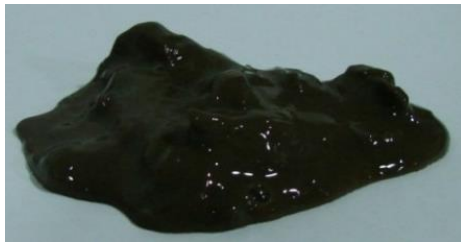
Recovered DOC & Fe

Concentrated DOC and Iron is filtered by Cuf and further dewatered by the integration of the DeWatering Recovery System (DeWRS). The integrated process eliminates liquid waste, creating zero liquid discharge that results in a wet sludge which can be sent to a digester or landfill. The process produces approximately 100 gal/day of >3% solids.