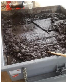
Recovered DOC & Fe

Concentrated DOC and Iron is filtered by Cuf and further dewatered by the integration of the DeWatering Recovery System (DeWRS). The integrated process eliminates liquid waste, creating zero liquid discharge that results in a wet sludge which can be sent to a digester or landfill. The process produces approximately 50 gal/day of >20% solids.