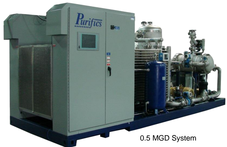
0.5 MGD System